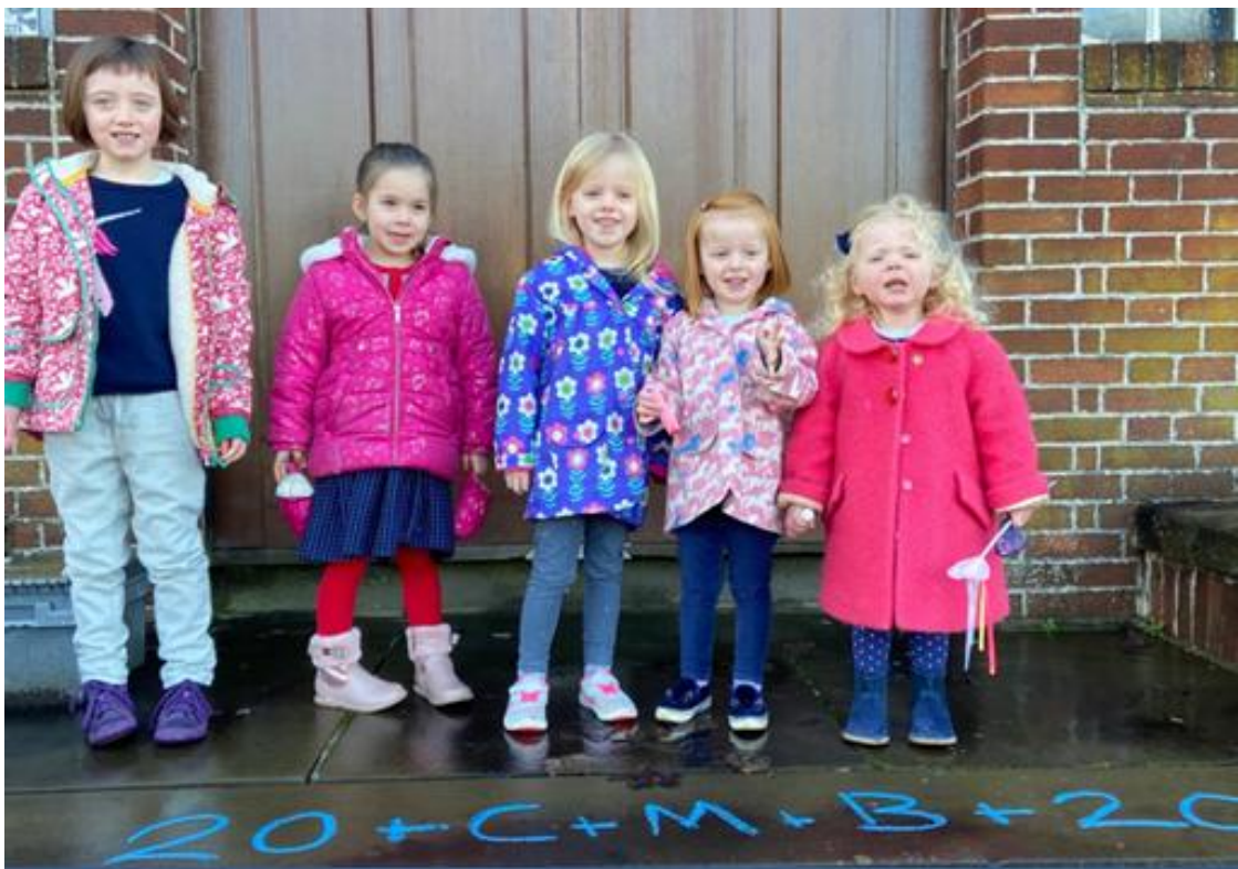
THE CHILDREN OF THE SUNDAY SCHOOL CHALKED THIS CODE AT THE ENTRANCES TO THE CHURCH AND HALLS